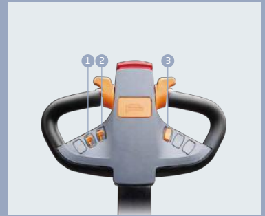
FREI multi-function tiller