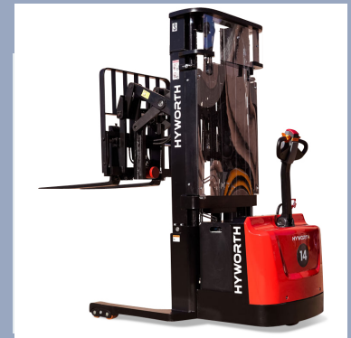
Travel speed is lowered automatically when fork is lifted to specified height