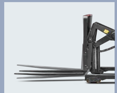
Mast tilting function is easy for entry in/out the pallet