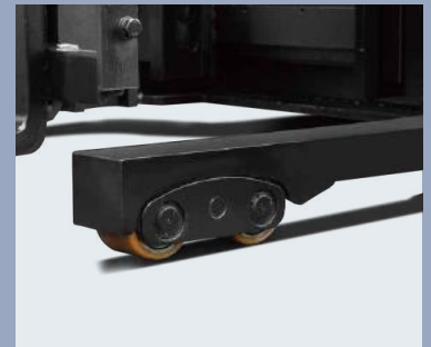
The structure of rotary load wheel offers the truck better passing ability