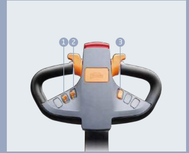
FREI multi-function tiller 1: Forks move forward / backward 2: Forks lifting / lowering 3: Forks tilt forward / backward